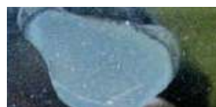
E. coli F18 + CELMANAX 2 mg/mL