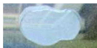
Control E. coli F18

Results: Light green clumps of agglutinated E. coli cells were seen when E. coli cells were mixed with CELMANAX LIQUID (Figure 1). The agglutination was directly proportional to the concentration of CELMANAX present. The agglutination was highest at 40mg/mL of CELMANAX and lowest at 2 mg/mL. No agglutination was seen in control. Similar results were obtained with CELMANAX DRY.