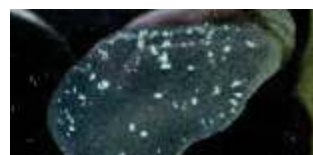
E. coli F18 + CELMANAX 20 mg/mL